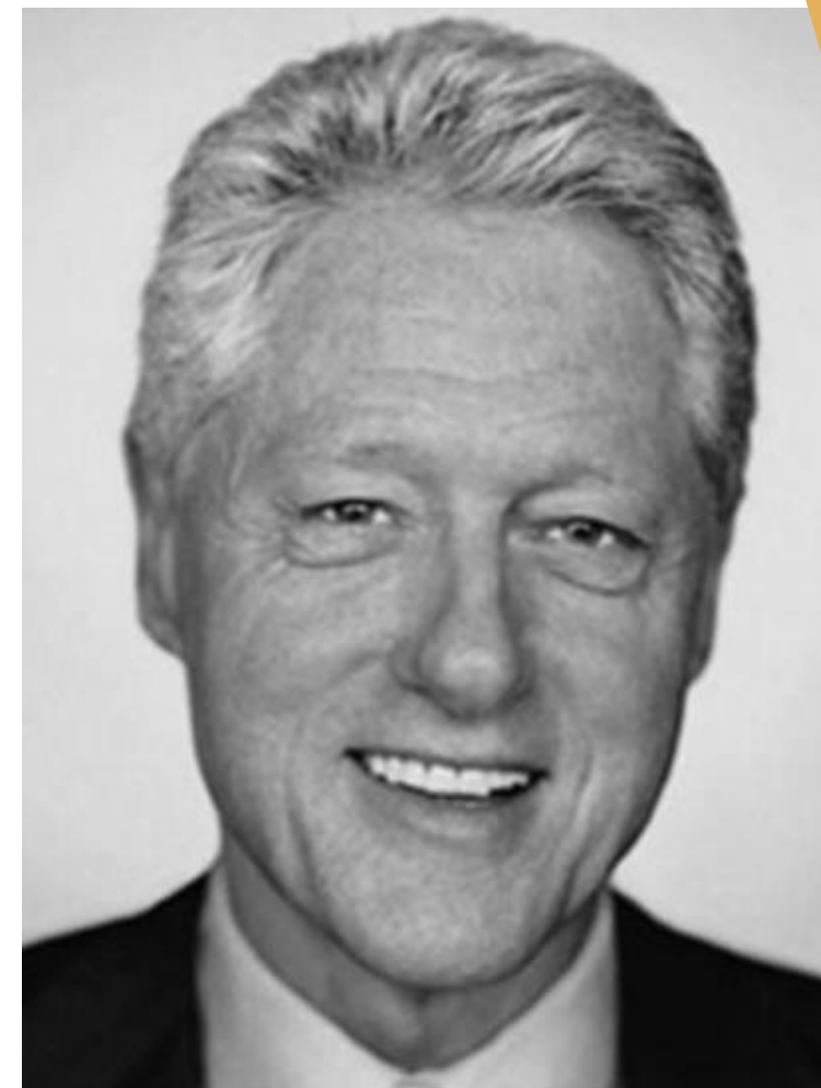
PRESIDENT BILL CLINTON

“...bringing people together in pursuit of a common cause, developing a plan to achieve it, and staying with it until the goal is achieved.”