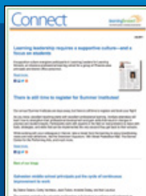
Connect e-newsletter Monthly newsletter