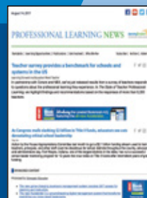
Professional Learning News e-newsletter Weekly newsletter