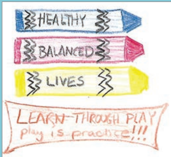
Examples of Stefani-Miller's sketchnotes, created during recent webinars and conferences.