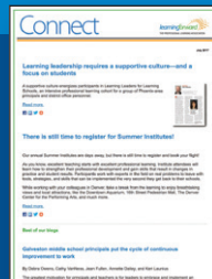
Connect e-newsletter Monthly newsletter