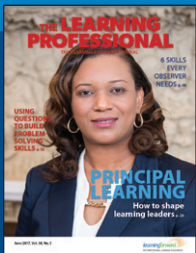
The Learning Professional Bimonthly magazine