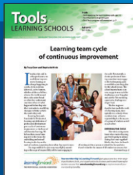
Tools for Learning Schools Quarterly newsletter