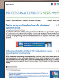
Professional Learning News e-newsletter Weekly newsletter