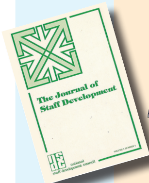
1980, first issue

JSD changes its name to The Learning Professional .