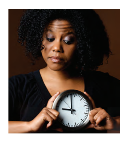
TIME FOR LEARNING