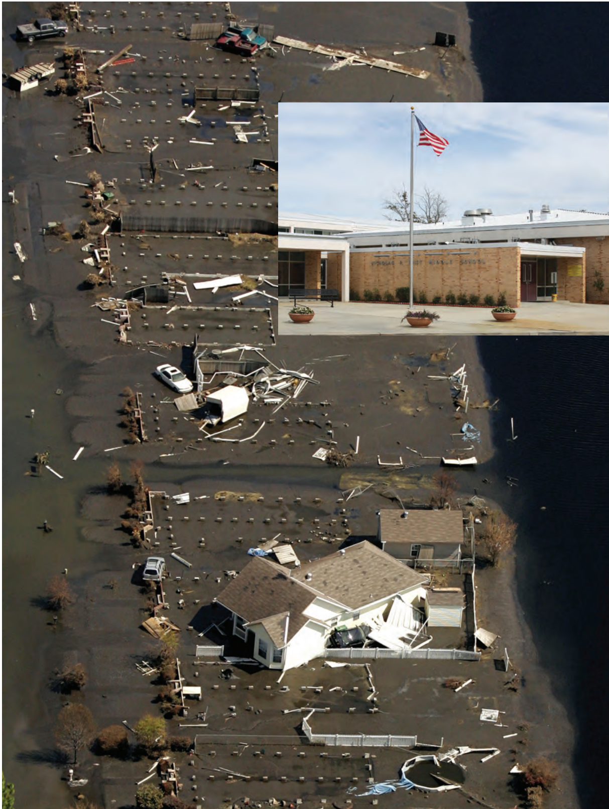
N.P. Trist Middle School, shown here in a November 2011 photo, was the only middle school in its district to reopen after Hurricane Katrina in 2005.