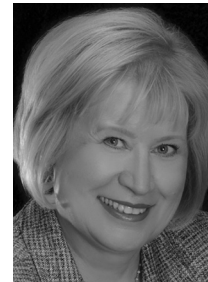
Pat Roy is co-author of Moving NSDC's Staff Development Standards Into Practice: Innovation Configurations (NSDC, 2003).