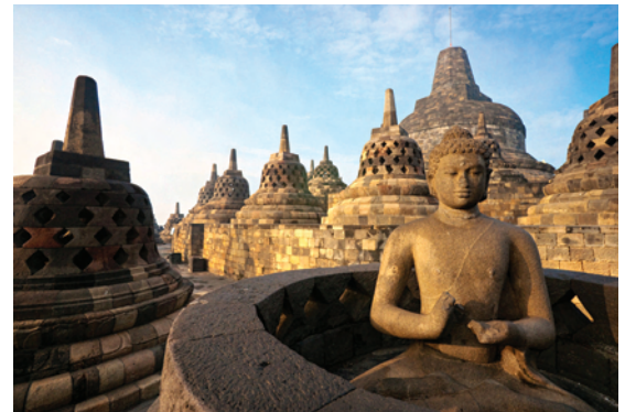
Borobudur Temple in Yogyakarta, Java.

There are many types of communities. Many online experiences are informal communities of interest that come together around a particular topic and then