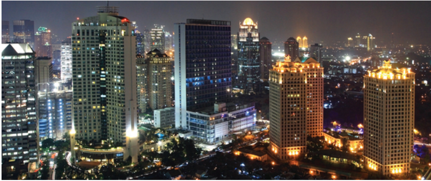
Above, nighttime in the capital city of Jakarta. At right, rice terraces in Bali.

Most of the two-day orientation with coaches focused on honing their online communication skills. Coaches discussed standards for good online writing,